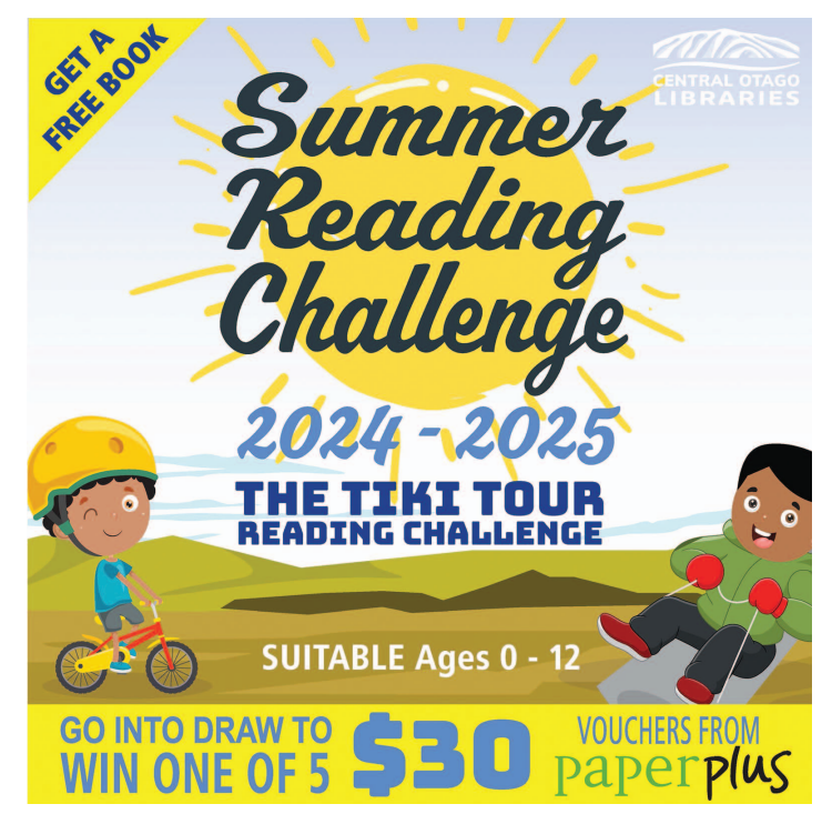
Entries will be accepted from 15 January - 7 February 2025.