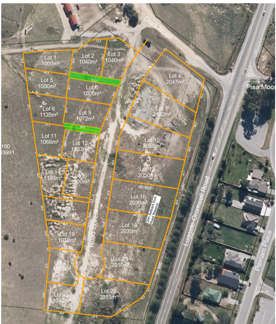
Figure 4. Proposed concept lot layout, Lot 100 DP 433991