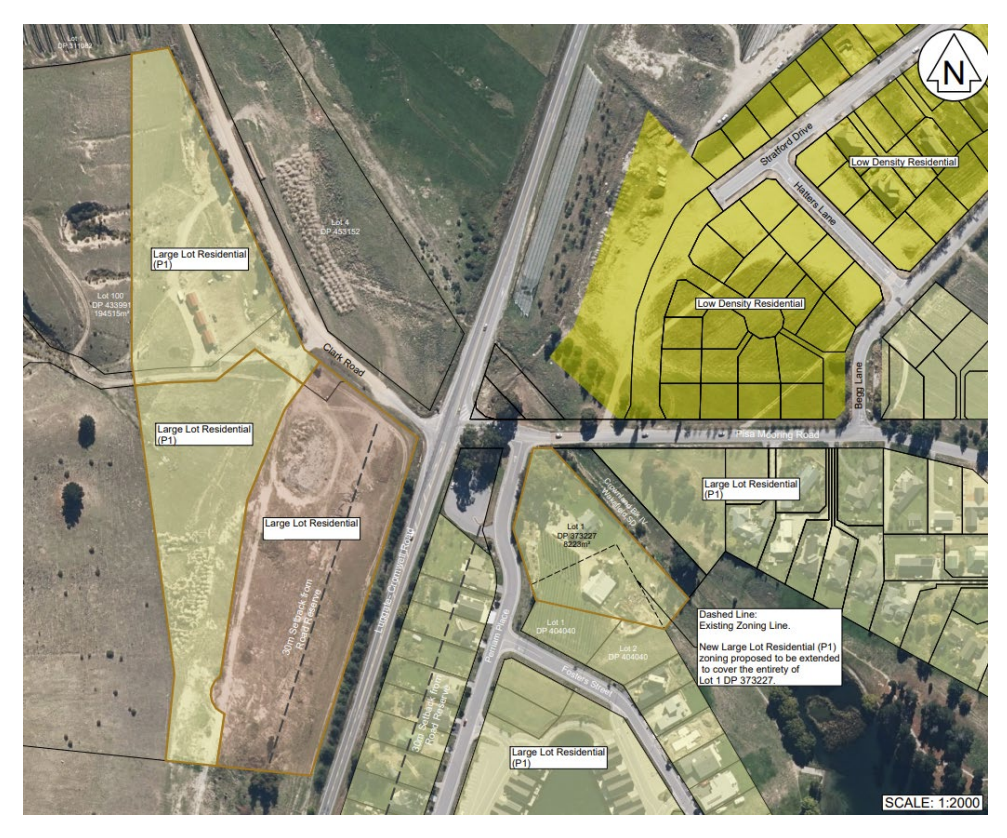
Figure 3. Proposed extension to District Plan Maps in vicinity of Clark Road, Pisa Moorings.