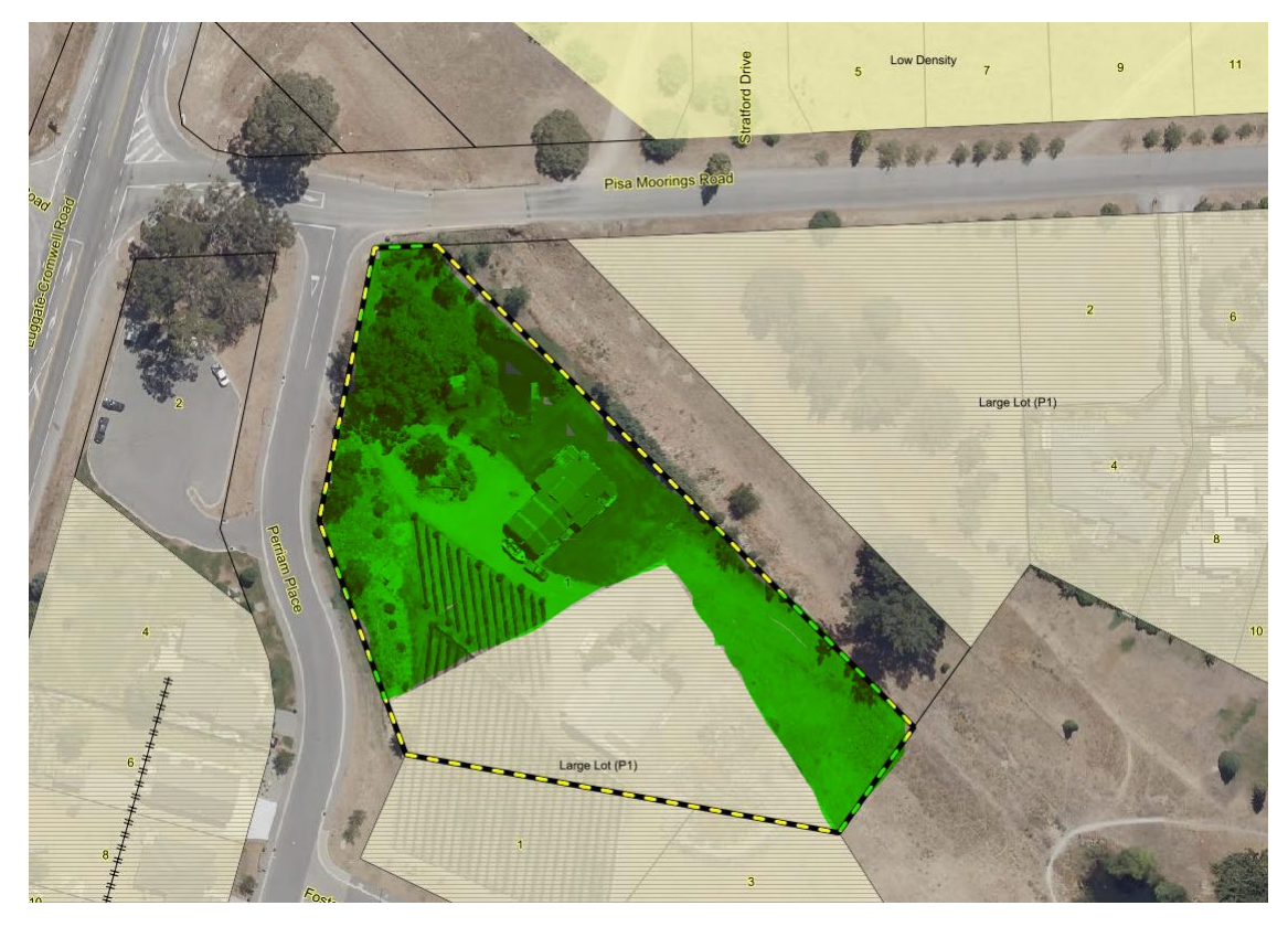
Figure 1. Proposed correction to District Plan Maps in vicinity of Lot 1 DP 373227.