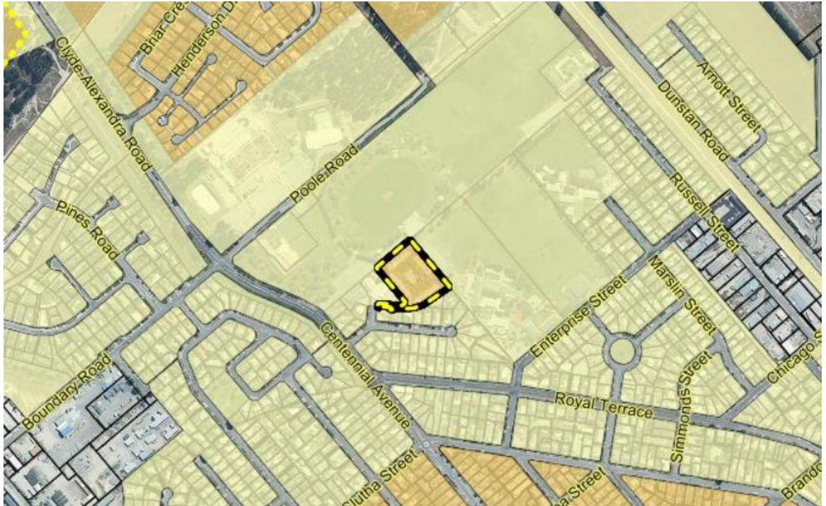
Figure 2: Area of MRZ on Gregg Street in Alexandria (identified by yellow and black outline) located further than 800m from a commercial area and surrounded by LRZ.