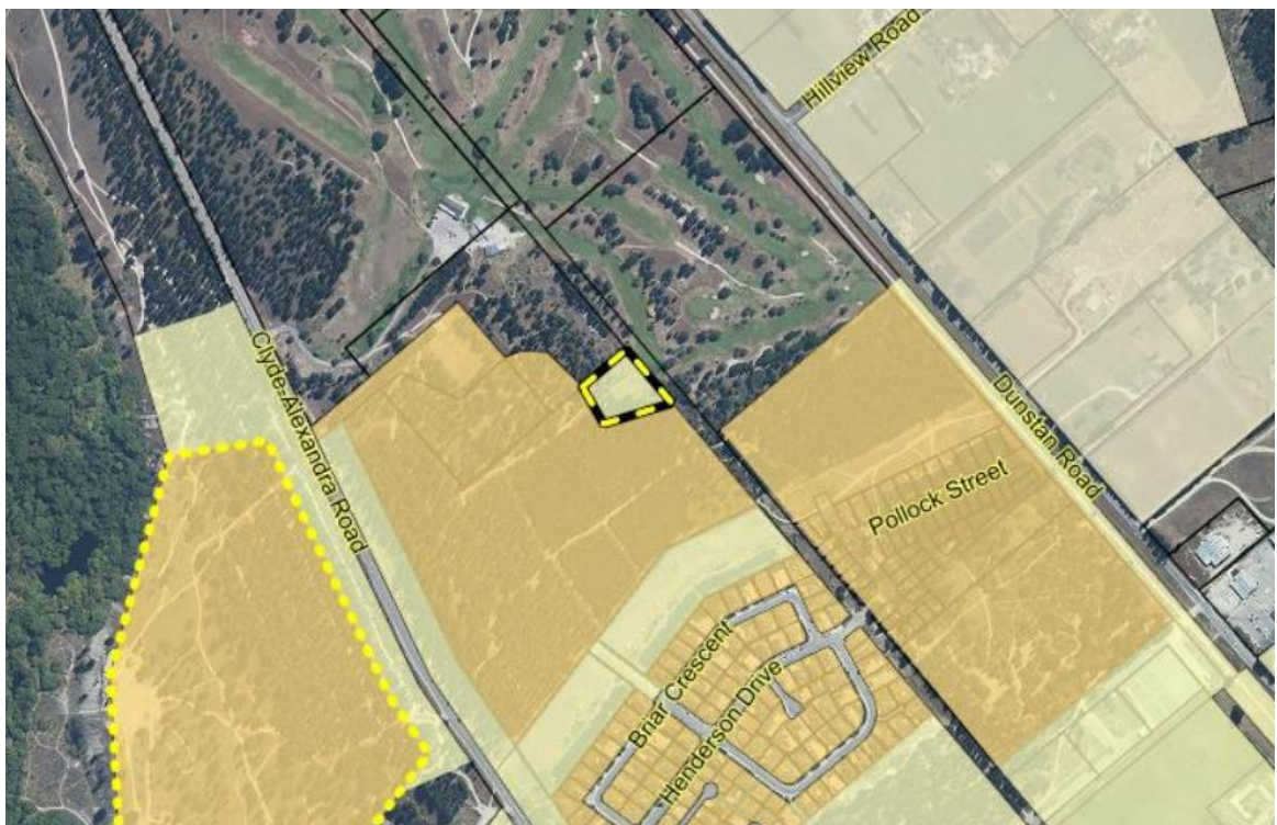
Figure 1: Site off the Clyde-Alexandra Road (identified by yellow and black outline) Zoned LRZ surrounded by MRZ and Rural Residential.