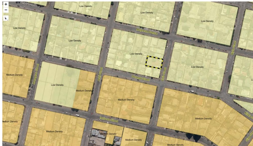
Figure 3. PDP Zoning.

4.4 In the Proposed District Plan "PDP" the subject site is zoned Low Density Residential Zone as illustrated in Figure 3 below: