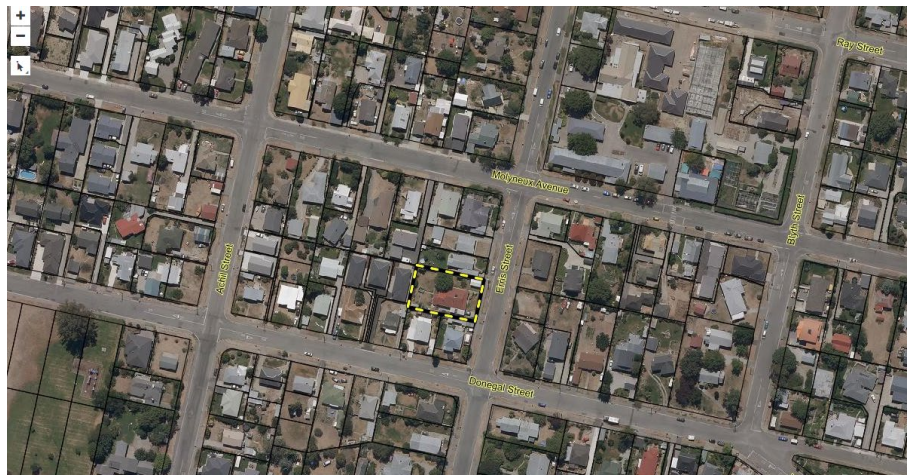
Figure 1. Submitters Property.

4.1 Crossbar Trust " the submitter " is the landowner of 47 Erris Street, Cromwell legally described as Lot 2 DP 3654 as illustrated in Figure 1 below: