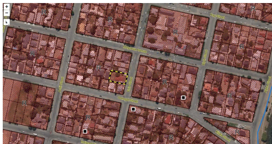
Figure 2. ODP Zoning.

4.3 In terms of the Operative District Plan " ODP " the subject site is zoned Residential Resource Area as illustrated in Figure 2 below: