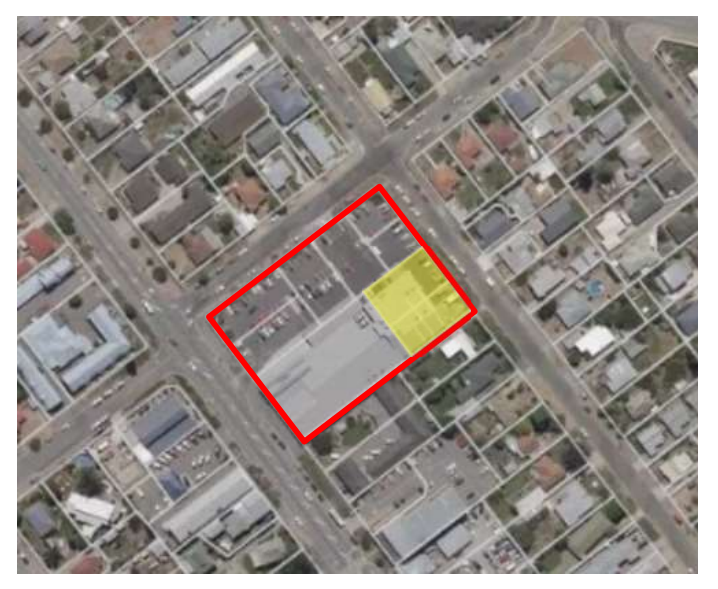
Figure 2A: Existing Environment, NW Alexandra