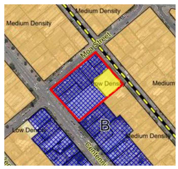
Figure 3: PC19 Planning Map, NW Alexandra