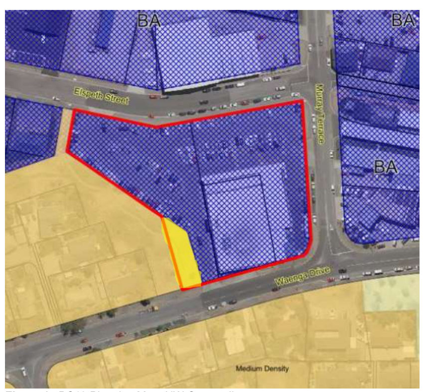
Figure 1: PC19 Planning Map, NW Cromwell

NW Cromwell (#62) - rezone from MDRZ to BRA