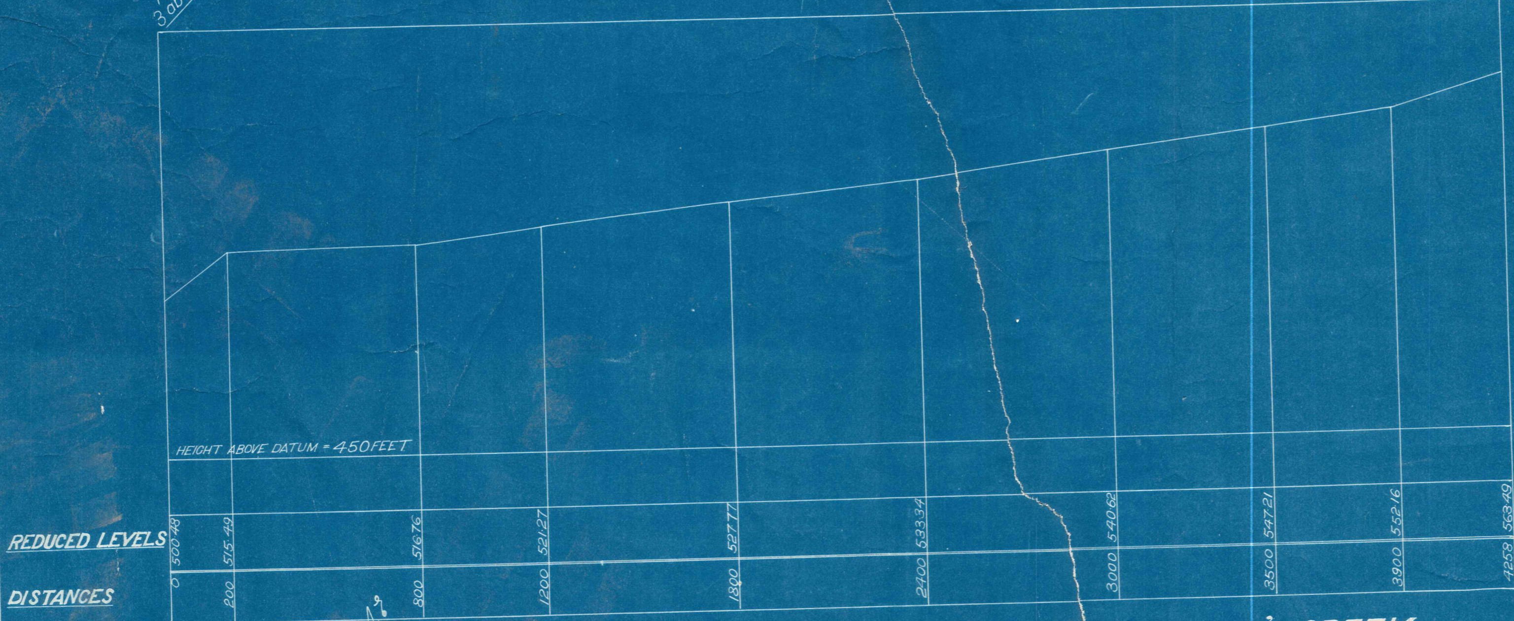
LONG TNL SECTION OF TRAVERSE OF CONROY'S CREEK.

SCALE: { HORIZONTAL, 3 CHAINS } TO ONE INCH { VERTICAL, 30 FEET }