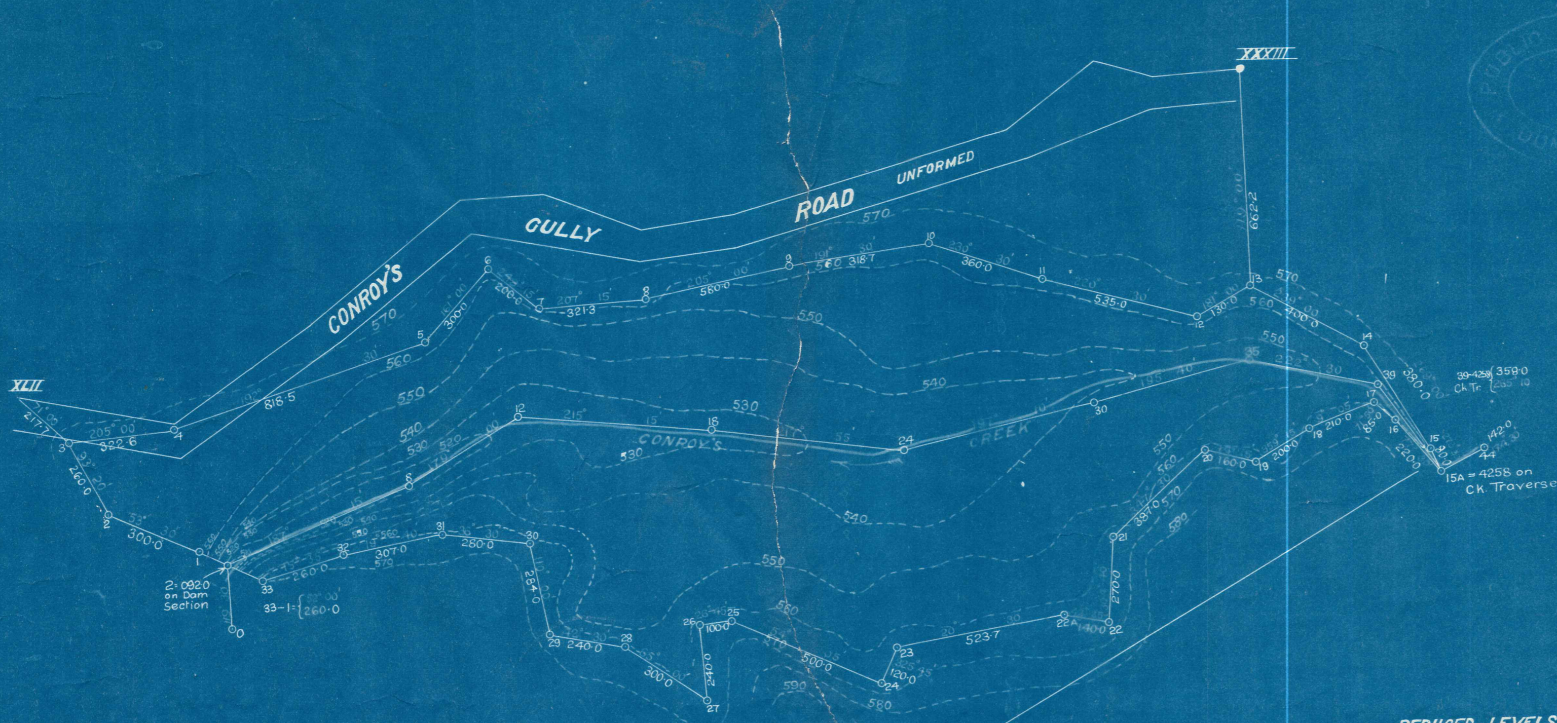
CONTOUR PLAN OF RESERVOIR SITE.