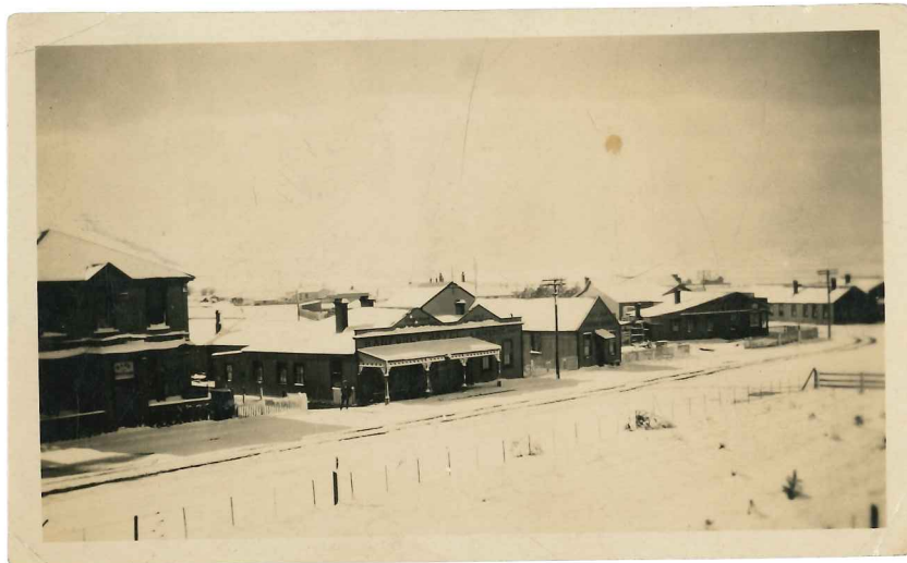
Hand written on the reverse: "Ranfurly, the east side of the railway line." 1920's.