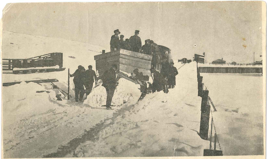
A STOPPAGE OF THE SNOW PLOUGH A FEW YARDS FROM ROUGH RIDGE STATION