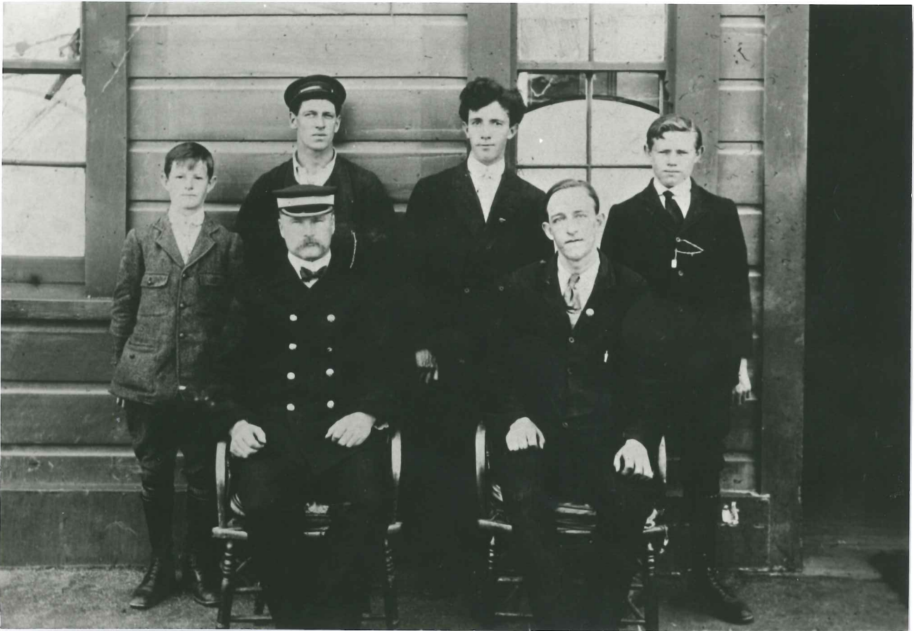
Railway staff, Ranfurly. (n.d.)

Images associated with the the railway, Maniototo. Sources and dates unknown.