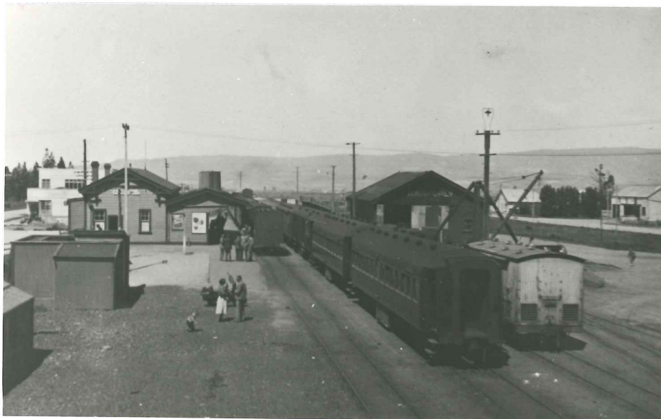
Photograph 33: A mid- 1950's shot looking south. The Centennial Tea rooms are visible on left- probably capturing most of the midday meal business at this time.