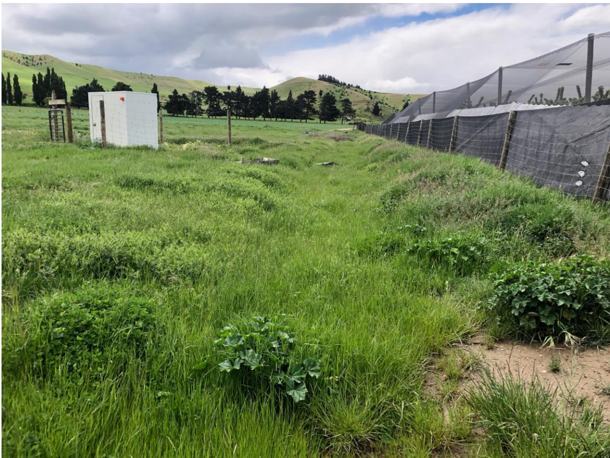
Image 2130: Existing channel about 1.5 m bottom width 0.6 m deep along SE boundary looking upstream from Ripponvale Road (taken: 30 October 2018)

Appendix A presents the existing flows paths and areas potentially subject to inundation. As part of the development it is proposed to clear out water race structures including culverts.