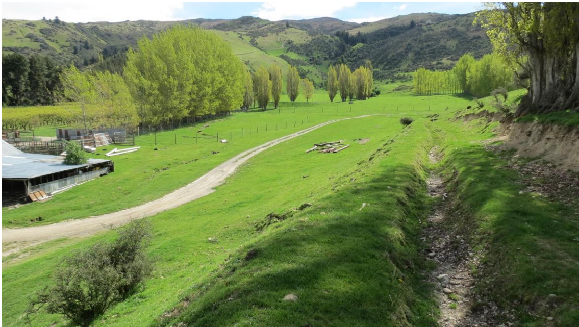
Photo 3509: Looking from water race up western gully, dam in middle distance. Flood path to left of road.