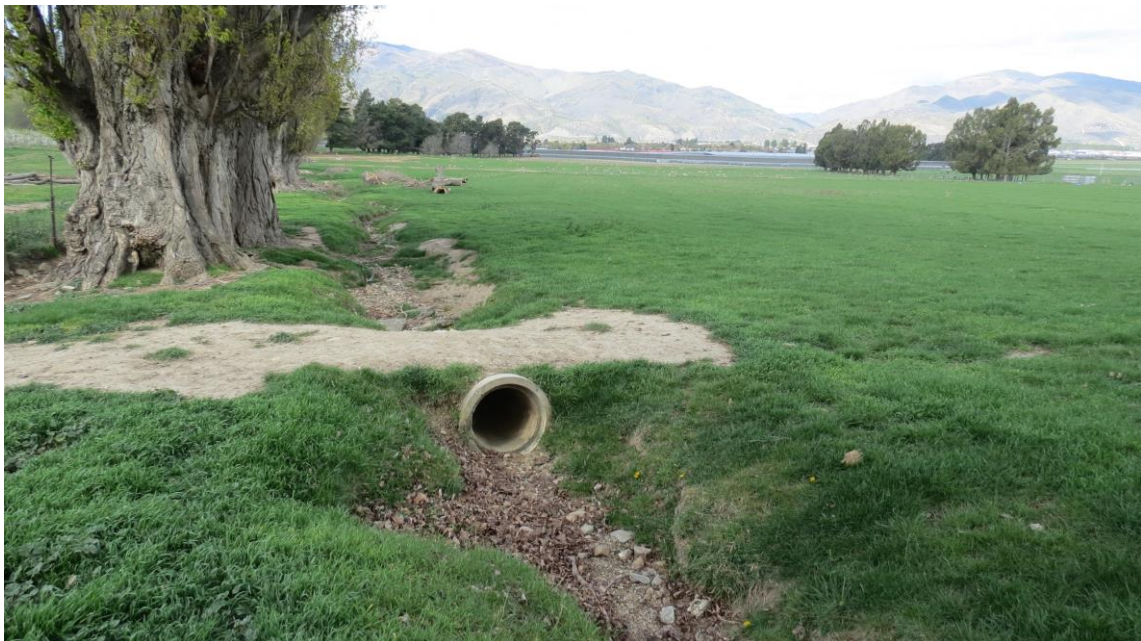
Photo 3511: Water race downstream of western gully outflow. 450mm culvert could block and overtop