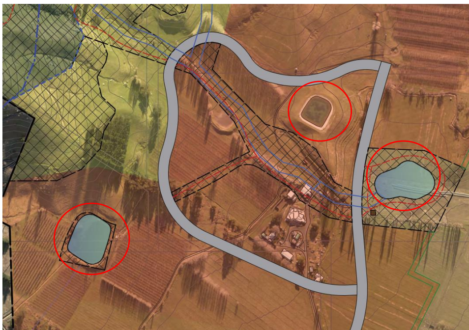
Figure 3. Location of existing small dams circled in red

Three small water storage dams are present on the site as illustrated on Figure 3: