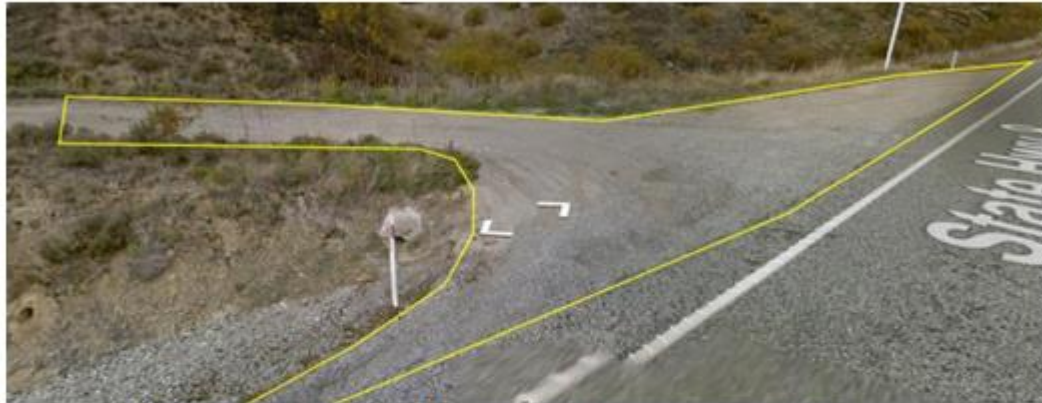
Figure 1: Area of access (CP32) to be maintained and where new seal is required