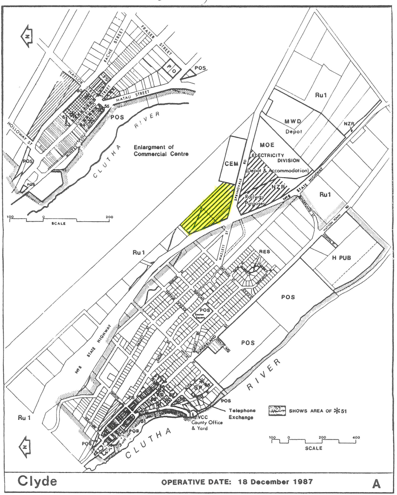
Finance Transitional (Vinent) District Plan.